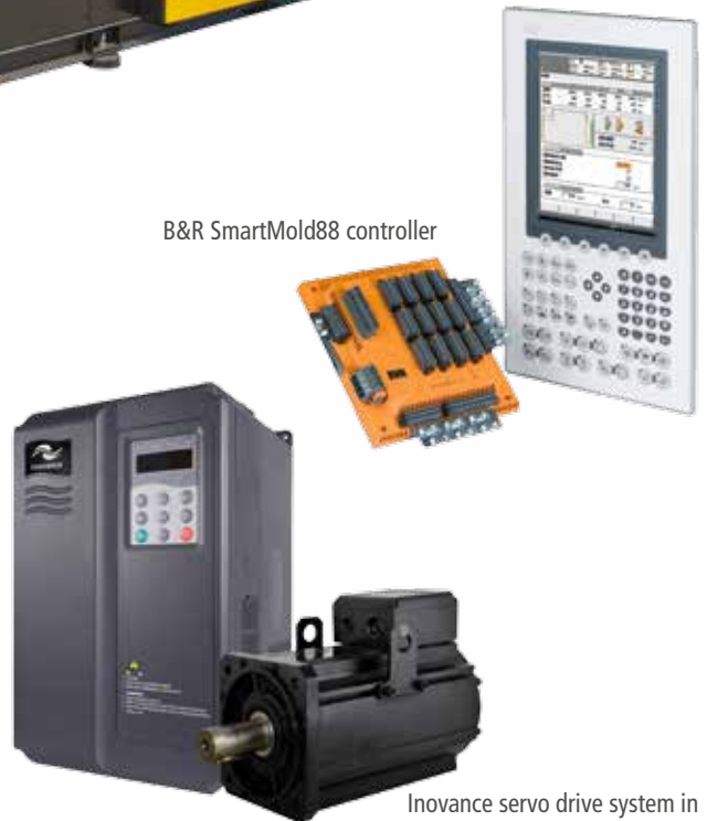
Inovance servo drive system in combination with German technology